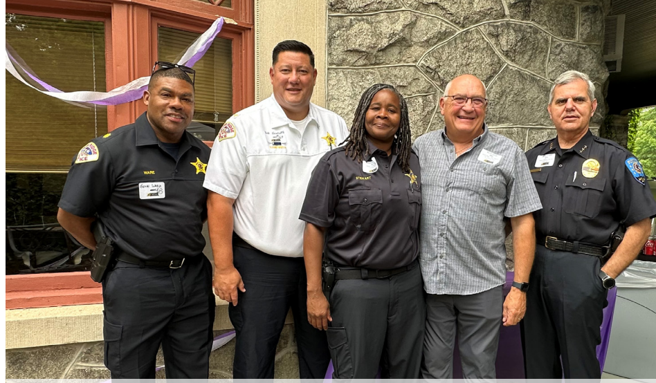
SPSC graduates gathered in Evanston to celebrate our 40th anniversary. Pictured are members of SPSC Classes #415, #319, #84 & #75.

More personal & professional friendships that last a lifetime.