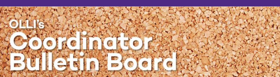
Note: You must be a current OLLI member to be a coordinator for any OLLI study group.